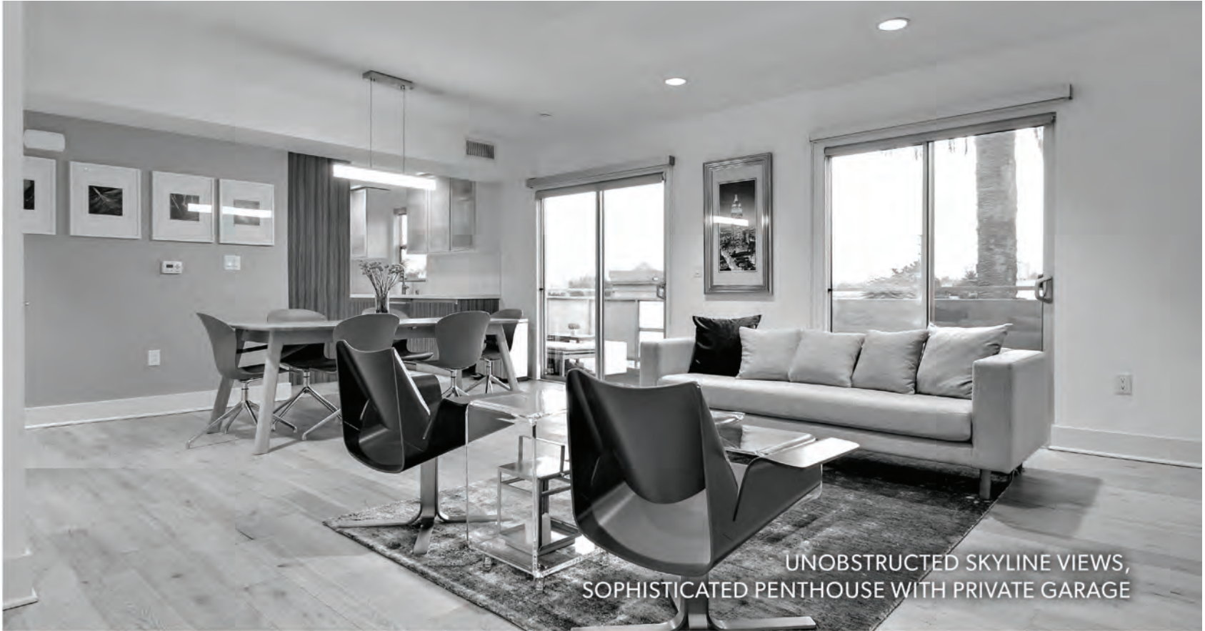
UNOBSTRUCTED SKYLINE VIEWS, SOPHISTICATED PENTHOUSE WITH PRIVATE GARAGE