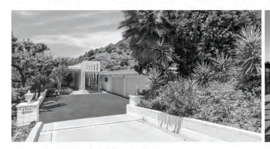
9128 Leander Place