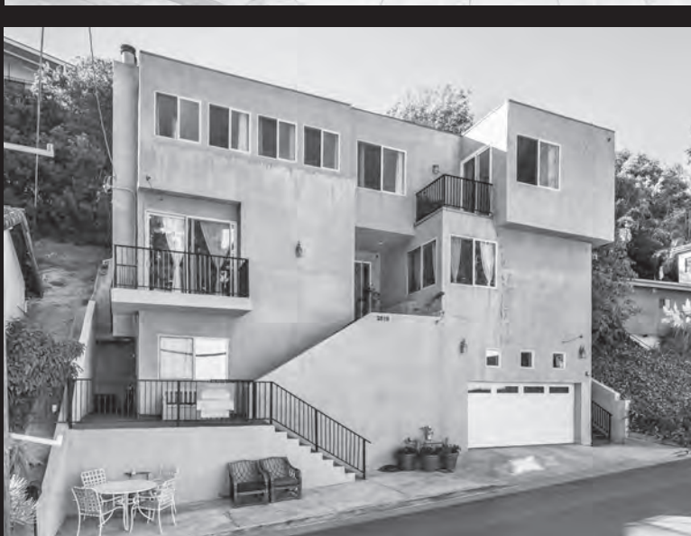
2619 RINCONIA DR. Los Angeles, CA 90068

IN THE HOLLYWOOD DELL, CLOSE TO LAKE HOLLYWOOD, THE BOWL, STUDIOS & 101 @ $430/ SQ. FT. Contemporary, spacious, light, bright, 3 bedroom, 3 bath home with an attached 1 bedroom, 1 bath apartment/mother-in-law unit with a separate entrance. High ceilings, expansive, open floor plan, eat in kitchen with granite