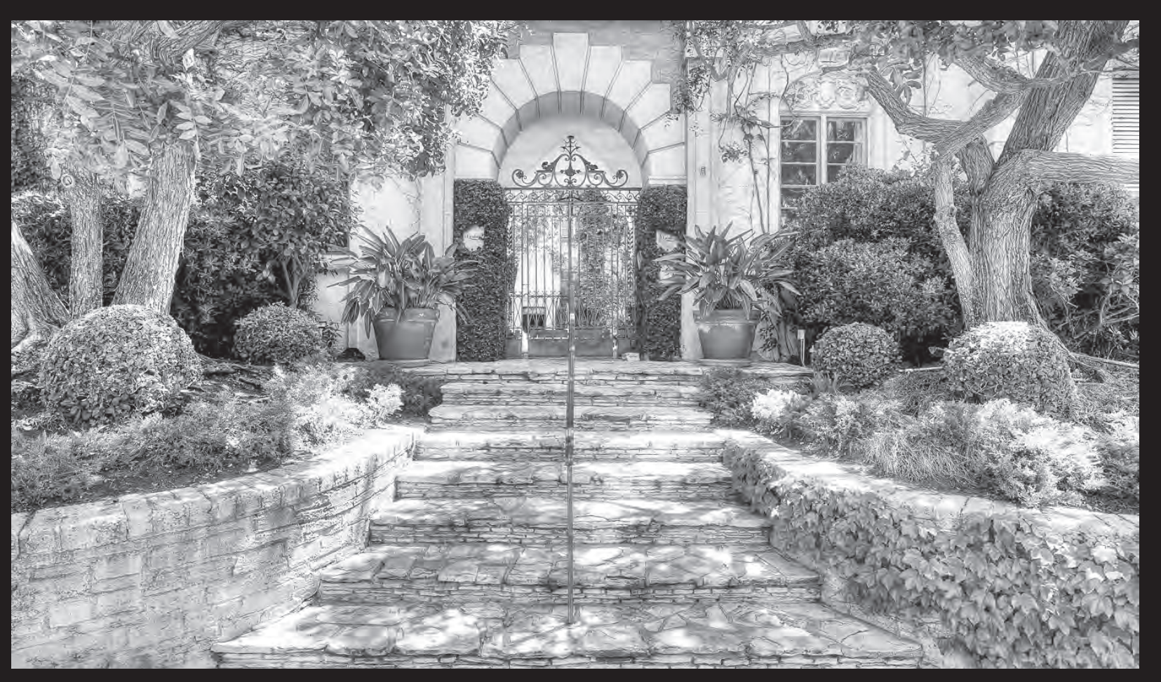
450 N SYCAMORE AVE #17, Los Angeles, CA 90036 SHOWN BY APPOINTMENT ONLY & EASY TO SHOW

BY APPOINTMENT. At the Il Borghese in Hancock Park. Furnished pied-a-terre lease in LA's most incredible architectural building an Italian Renaissance gem. This lovely furnished one bedroom, one bathroom is on the top floor. It features hardwood floors, recessed