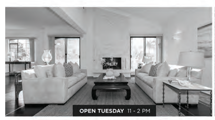
OPEN TUESDAY 11 - 2 PM