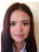
Lulu Knowlton Residential Division