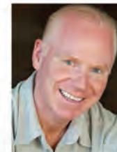
Cultural Icon Pete Castro Pete Castro Group