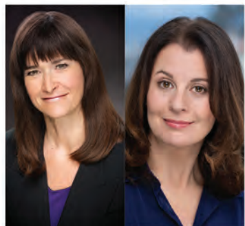
Pacific Portfolio Properties Beverly Hills Top Team