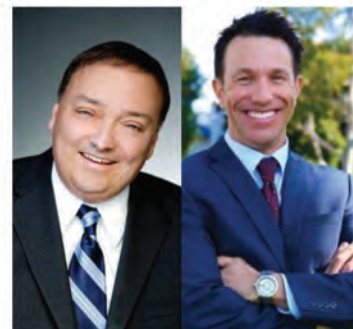
Hartman Cole Group WLA/Westwood Top Team