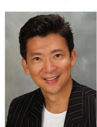
Charles Le Beverly Hills