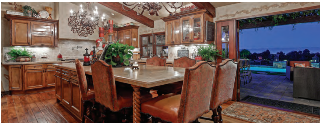
CalBRE #00983568 and #01879720