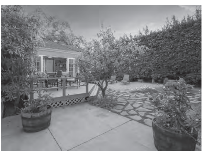
1056 Stearns Drive Carthay Square

2bd 1ba + Guest House Listed at $1,249,000