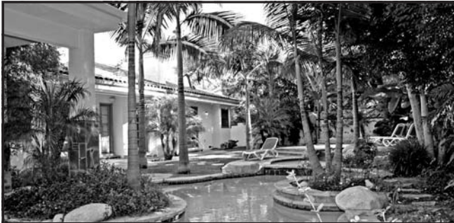
OPEN HOUSE – Sunday, February 12, 1–4pm