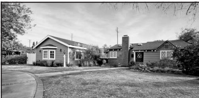
OPEN HOUSE – Sunday, February 12, 1–4pm