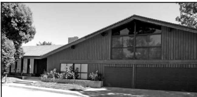
SHOWN BY APPOINTMENT