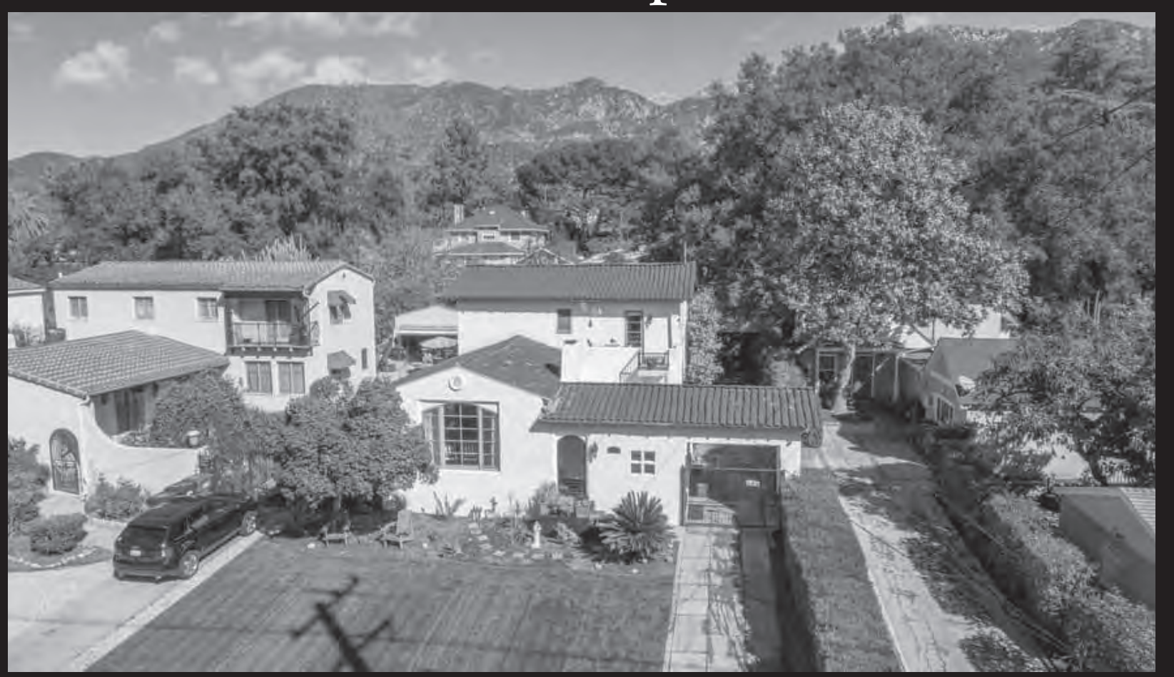
157 E ALTADENA DR Open Tues Feb 12th & Thu Feb 14th 10-2pm & Sat & Sun 1-4pm

In the foothills of Altadena, this darling, 2-story, Spanish Classic awaits your arrival. You'll be wowed by the abundant architectural details in the 1926, gated beauty. The 3 bedroom, 2 bath home sits upon a 9000+ square foot property. Inside, the light filled rooms are airy and spacious.