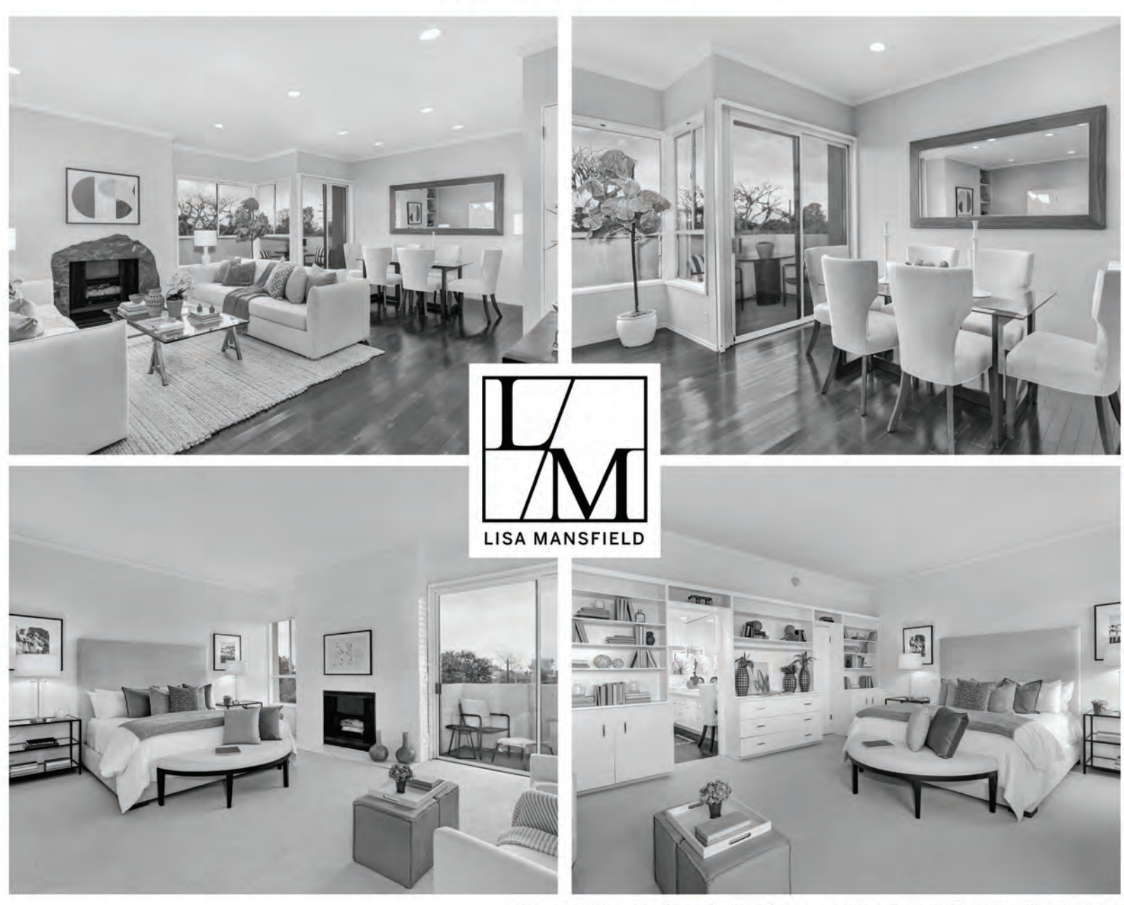
Coastal New York Style Penthouse | 2BD,2BA | Offered at $1,189,000