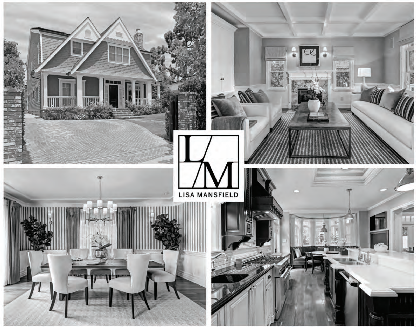
Sophisticated Hideaway in the Heart of Brentwood | 5BD, 5BA, Family Rm | Offered at $3,545,000