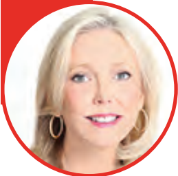
Patti Wood National Speaker Body Language Expert