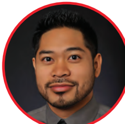
Daryl Espina Online Scheduling, ShowingTime