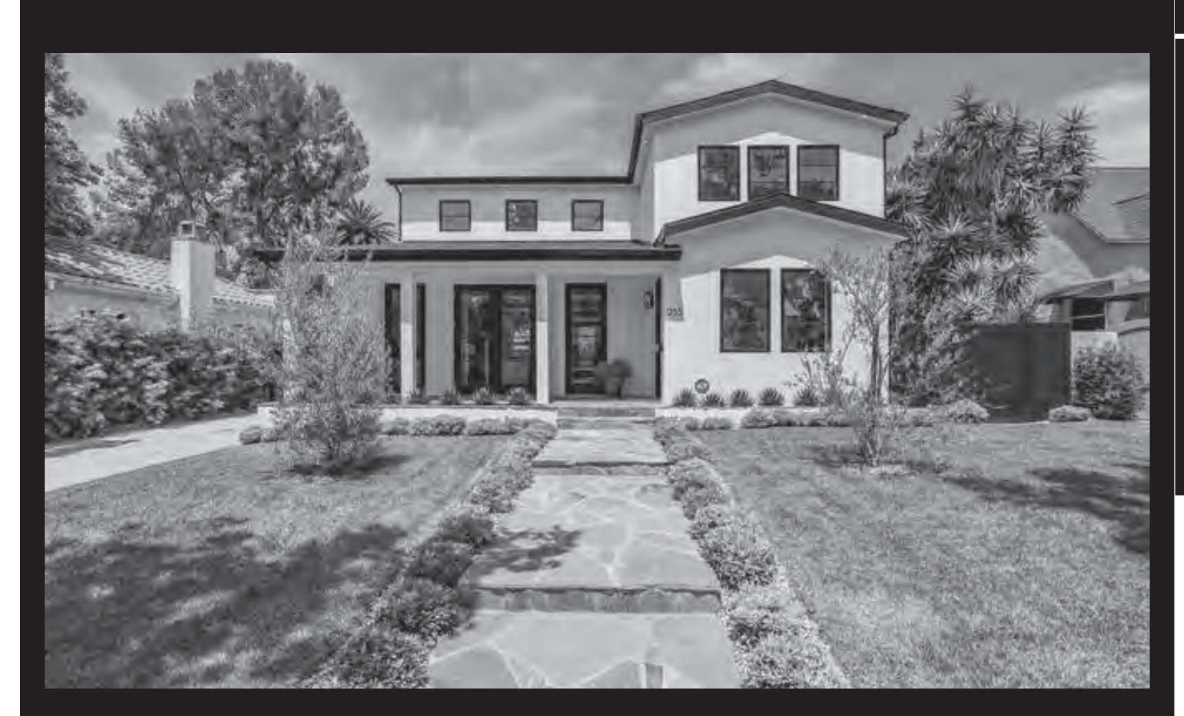
935 S BURNSIDE AVE

Brand new 4+6 contemporary w/deck + pool + spa. Formal light filled entry w/ sleek staircase. Open concept living room/ dining room/kitchen. Character fireplace, wood beams, abundant natural light. Thermador stove/Italian Carrera