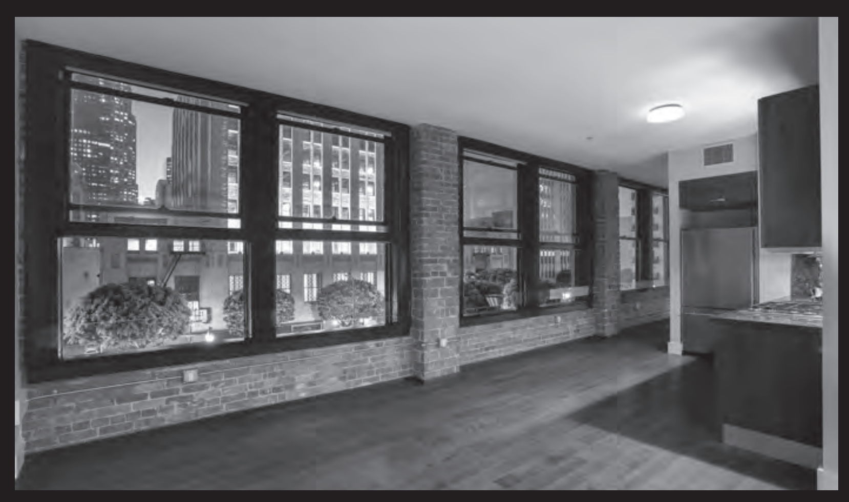
460 S. SPRING STREET, #403, in the Rowan Building! OPEN Tuesday 630pm-830pm AND Sunday 2pm-5pm

Welcome to your new home in the extraordinary Rowan building! Located in the historic downtown core of Los Angeles, this celebrated landmark built in 1912, has a Mills Act designation (saving homeowners up to 70% on property taxes). This one bedroom, west facing loft has