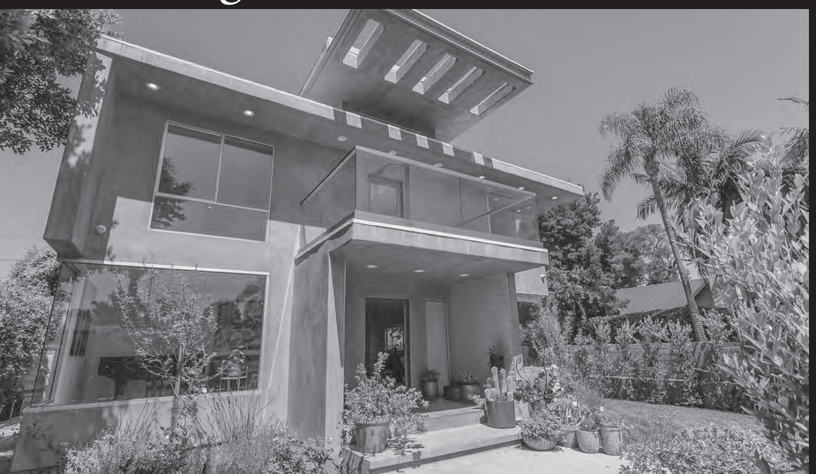
959 N VISTA ST 7/30/19, 11am - 2pm

Gorgeous brand new construction in Weho adjacent. Beautifully designed with attention to detail and comfort. Wonderful outdoor space with lush landscaping. Private and